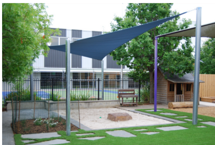
New sand pit at Dallas Kindergarten