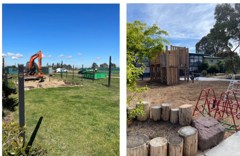
Transforming the outdoor play spaces at Upfield and Lorne Street