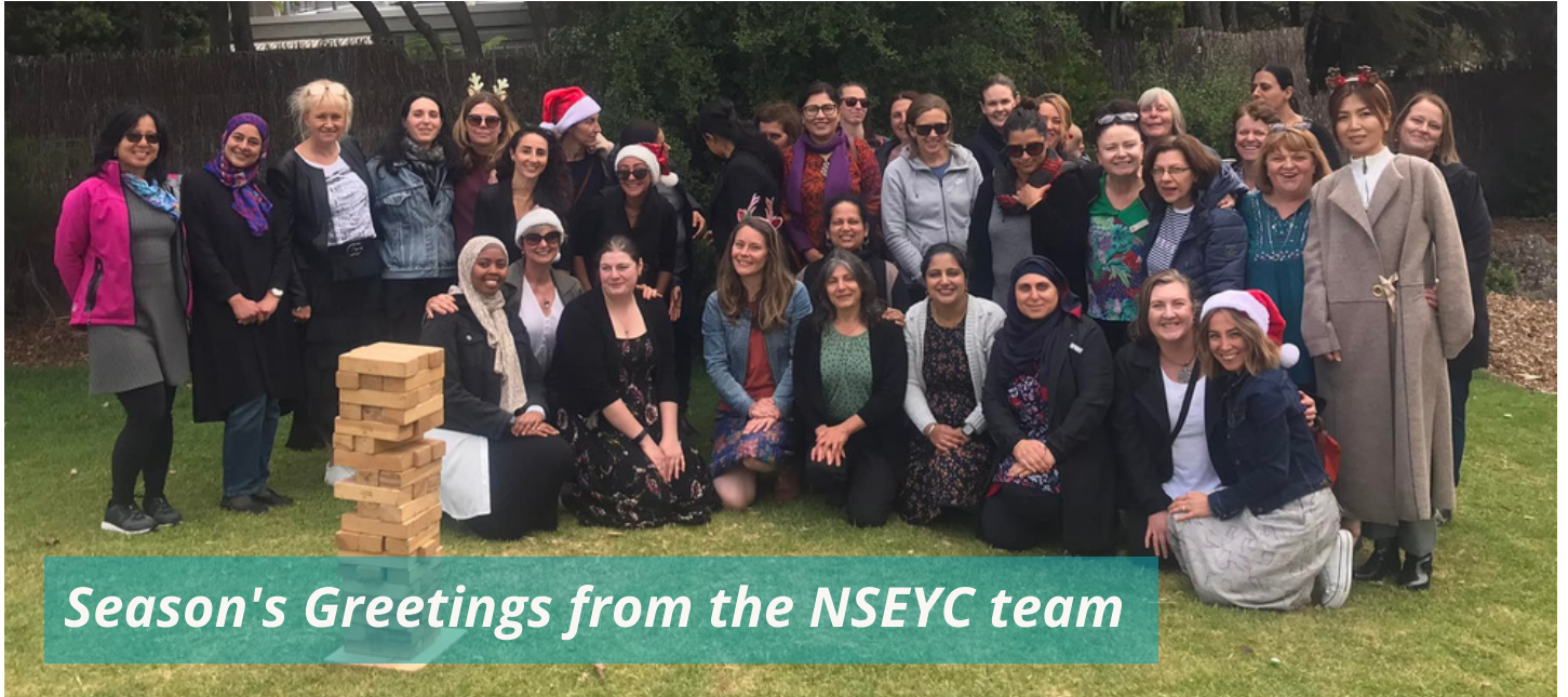
Season's Greetings from the NSEYC team

The Official Newsletter of the Northern Schools Early Years Cluster