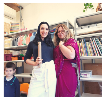
Upfield and Meadows Kindergartens celebrated with delicious food, while the Bethal Kindergarten team dressed in traditional clothing.